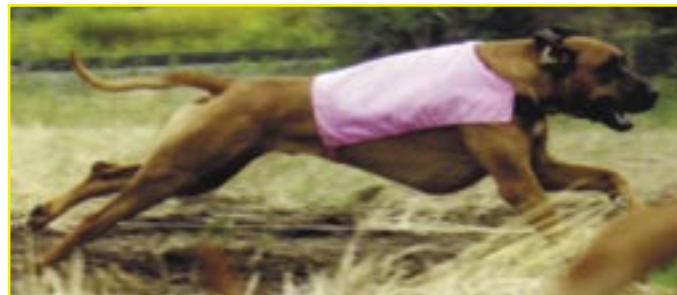
Spencer in his first coursing event, the OCRRC Regional Specialty, where he went Best in Field.