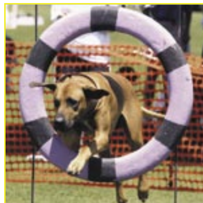
"Air Spencer" demonstrating his agility.